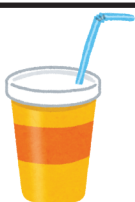
gaau -1 bui -1 膠 杯 can