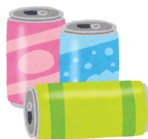
leoi -5 gun -3 鋁 罐 cans