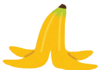
hoeng -1 ziu -1 pei -4 香 蕉 皮 banana peel

Cut out and paste the objects into the correct waste bin.