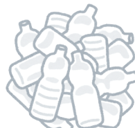
gaau -1 zeon -1 膠 樽 plastic bottles