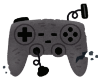
waai -6 wun -2 geoi -6 壞 玩 具 broken toys