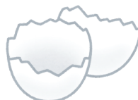
daan -2 hok -3 蛋 殼 egg shells