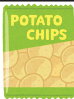
syu -4 pin -2 doi -6 薯 片 袋 chip bag