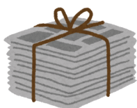
zi -2 zoeng -1 紙 張 paper